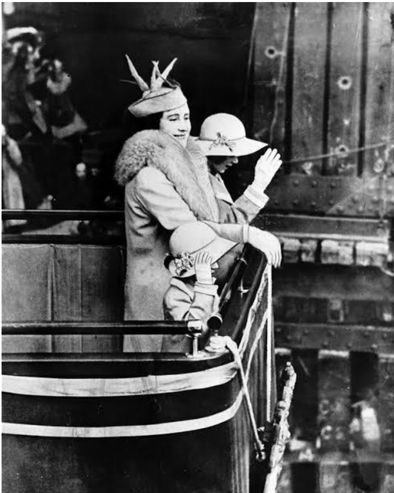
Here on this picture we can see our young Princess Elizabeth and her sister Princess Margaret accompanied by their mother Queen Elizabeth The Queen Mother.

Europe, the Queen Elizabeth made her maiden voyage in a absolutely secret to New York City, she was painted in grey color, just like her sister Queen Mary, in these days the New Yorkers could admire the three biggest ships in the world, S. S. NORMANDIE, R. M. S.QUEEN MARY and R.M.S.QUEEN ELIZABETH, NORMANDIE she was a French liner, at time she was docked in New York City without return forecast, the French would've been invaded by the German, and many French ships would be docked in New York City.