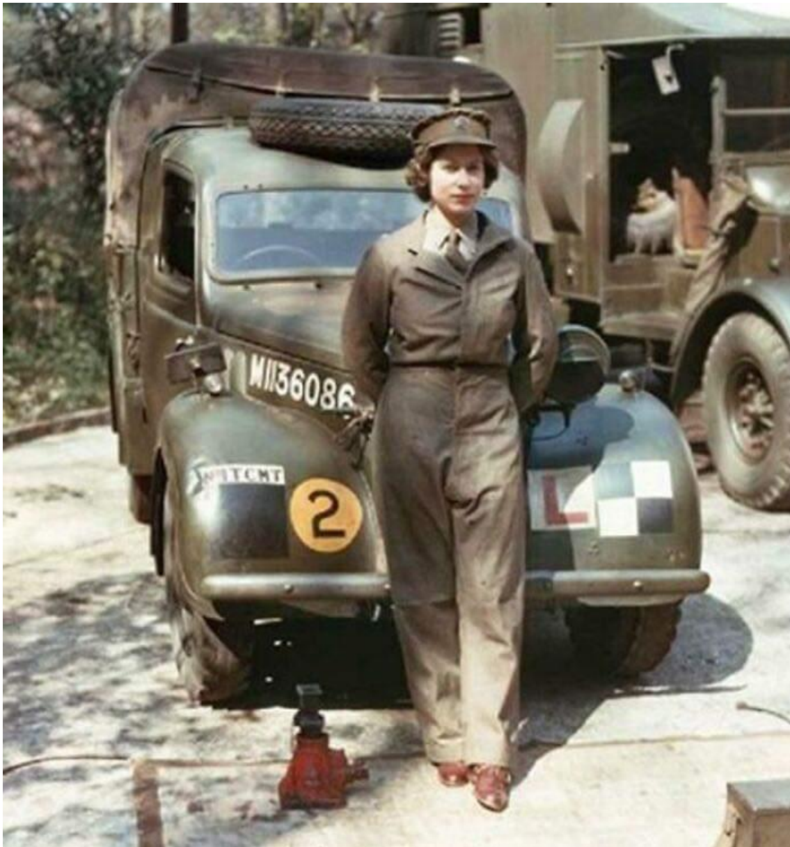
Here we can see a young Princess Elizabeth during the WW2.

scene of a major emergency with a well-ordered unit and intact command structure can be another motivation.