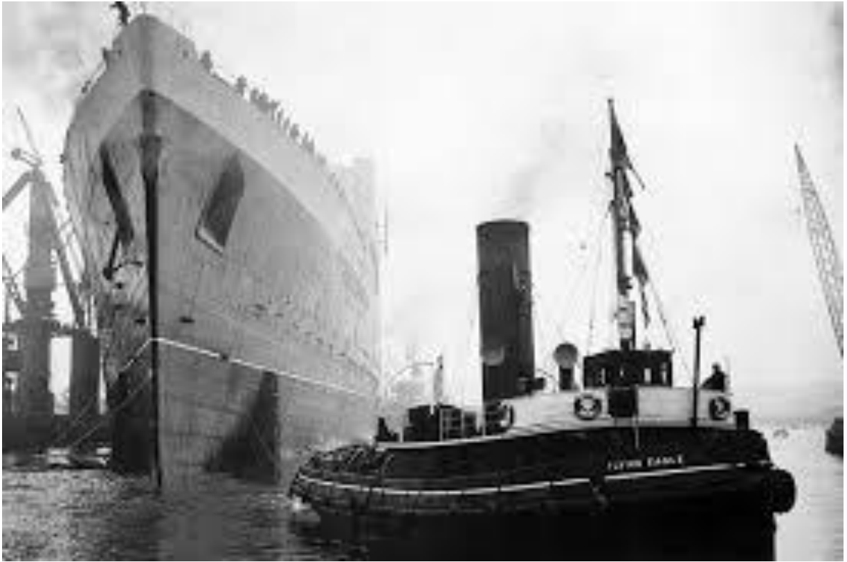
The launch day of the Queen Elizabeth at Clydebank shipyards.