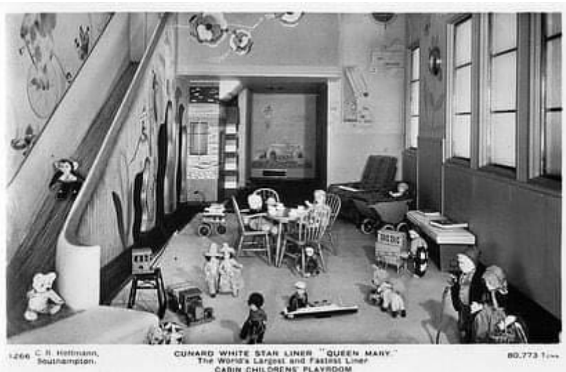
The Children's playroom on board the Queen Mary.

The same place it was visited by our young Princess Elizabeth, who would later become Queen Elizabeth II, when the Royal family came to tour the ship before the Queen Mary's maiden voyage.